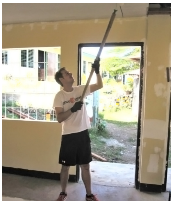
A volunteer works on the ceilings of the classroom.

On his last day, the volunteer painted the entire wall of the building and the half portion of the ceiling.