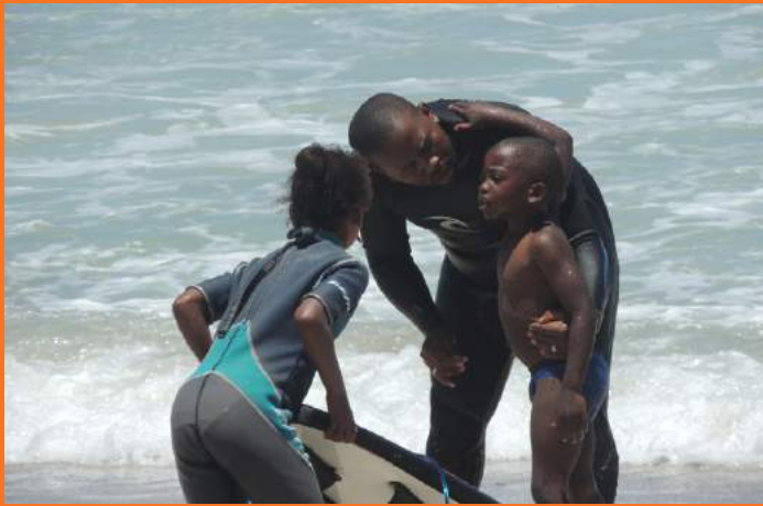
Photo Spread I Surfing