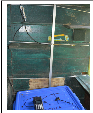
Some Of the Radio Tracking Equipment.

Finally in the rescue centre I would like to bring you up to date on Simba/Bilbo (he currently has two names). Our baby Puma is doing very well indeed, he has put on a lot of weight since he arrived so is now looking a lot healthier and his attitude is getting a lot better towards people. We are still moving ahead with plans to locate him in a decent cage and see what we can do with him for the future, but as experience from Preciosa has showed us these things take time and not always successful.