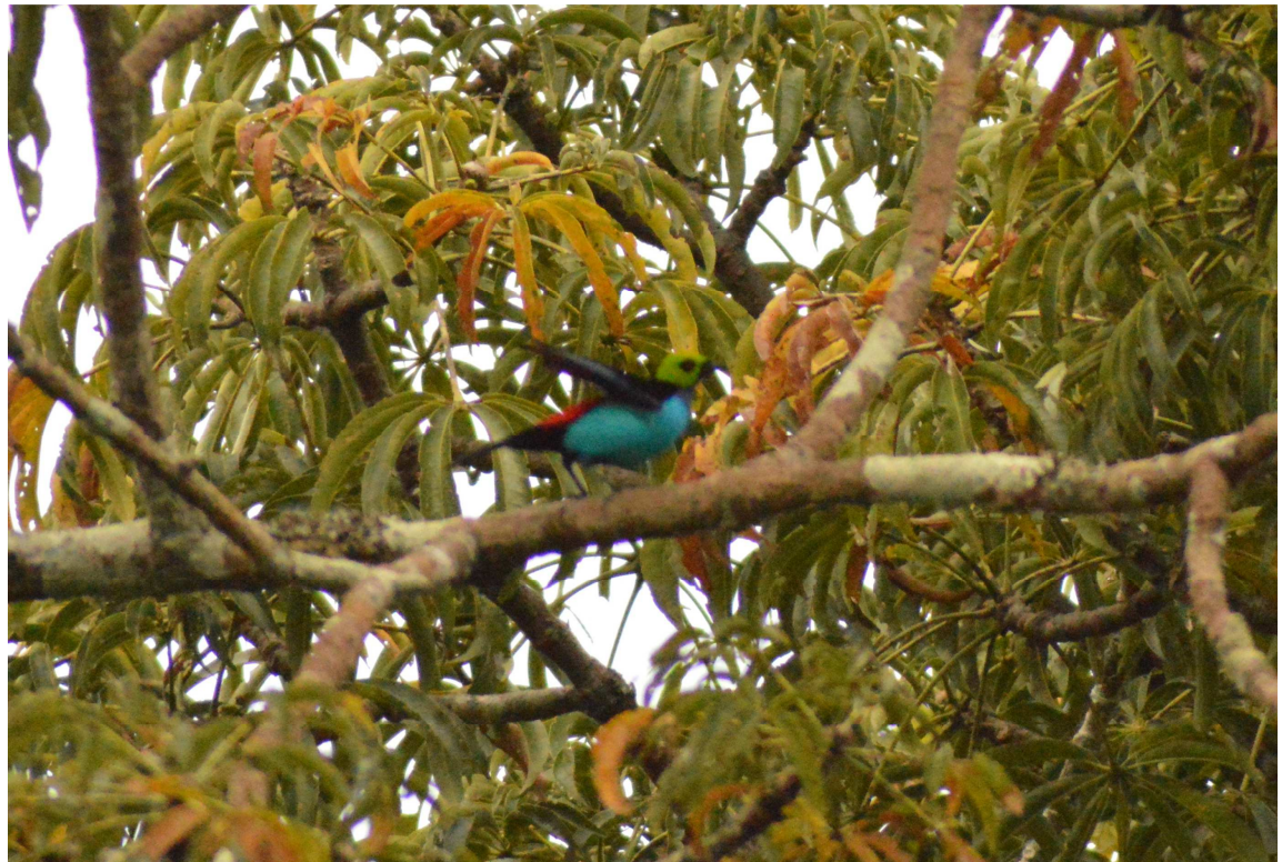
One Species Which Can Be Seen In Taricaya, A Paradise Tanager