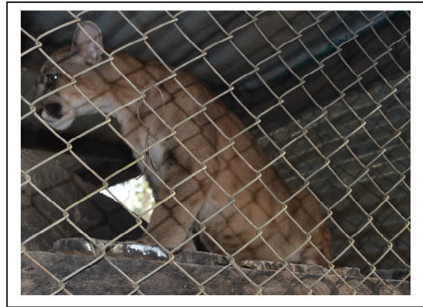
Simba has Grown a lot!